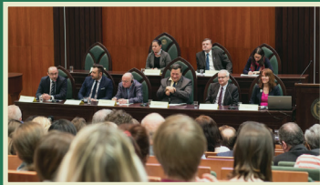
3rd SPAY conference p. 8