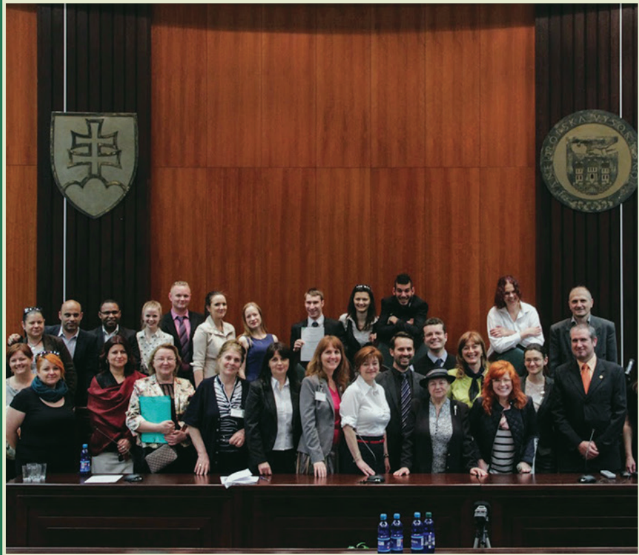
1st SPAY conference p. 3

st. Elizabeth University of Health and Social Work journal